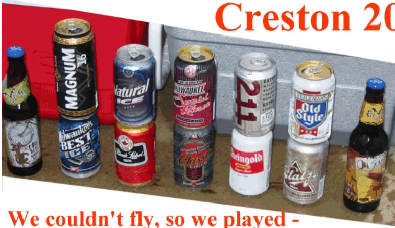
We couldn't fly, so we played - Crappy Beer Contest, Parade, baggy toss