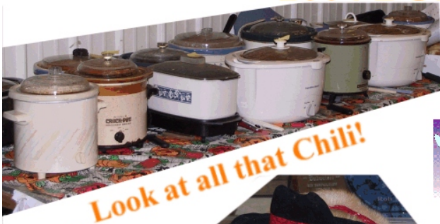
Look at all that Chili!