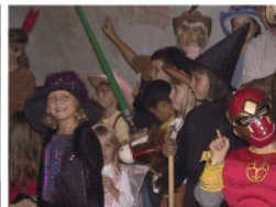
Kids in Costume