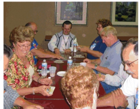
Hot card game