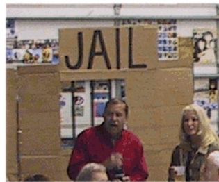
BOI Saloon & Jail