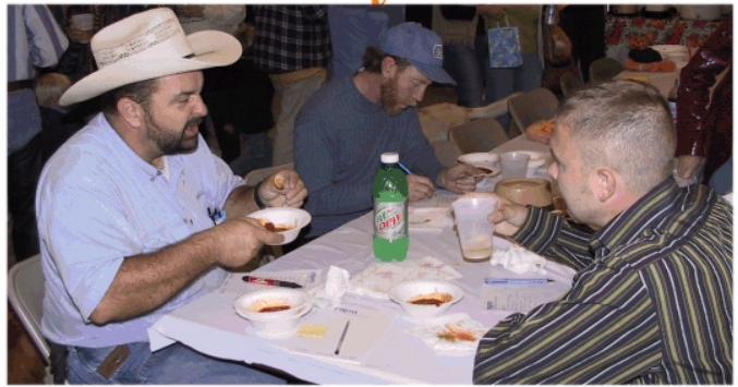
Chili Cookoff Judges