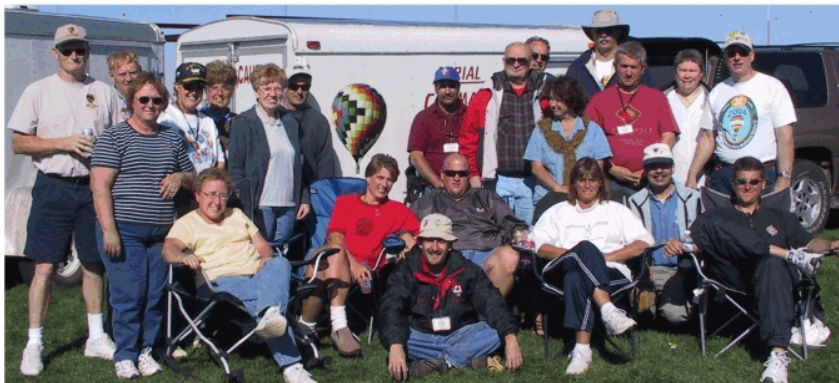
The whole Iowa gang