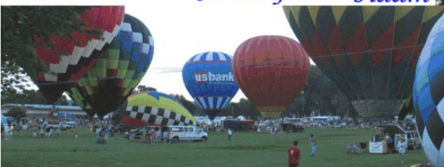
Touch & Go