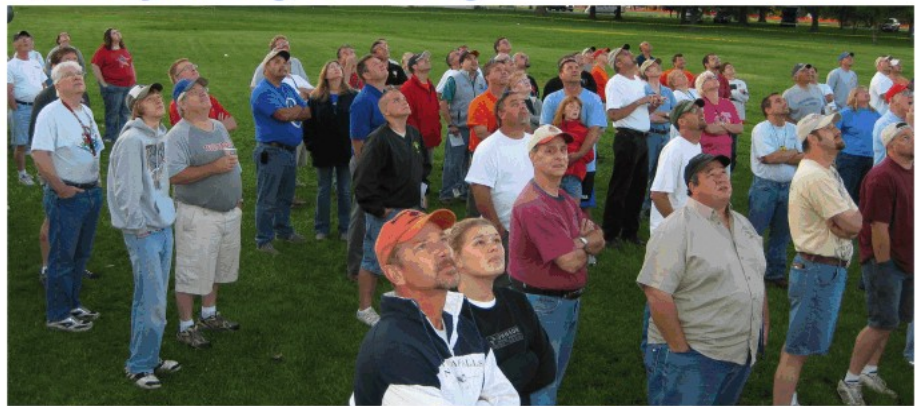
Pilots & crew watching pibal Sunday a.m.