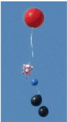
Or send off purple monkeys