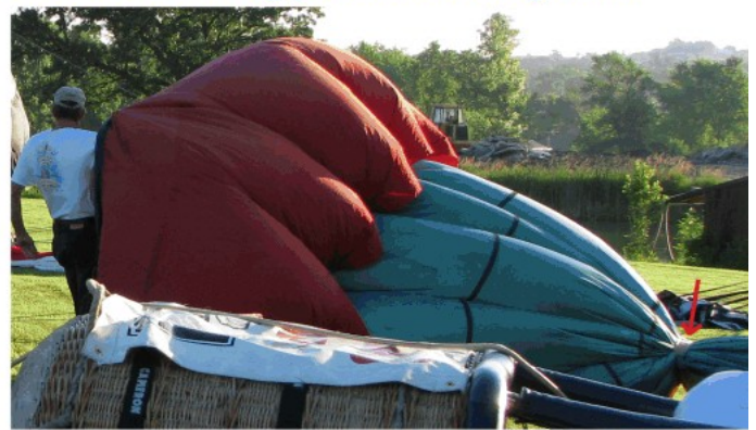
Gomer - it might inflate better without the straps!