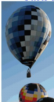
Benji & Cory