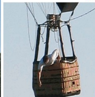
and drops in the winning baggie