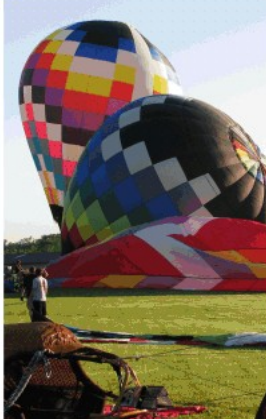
Let the games begin