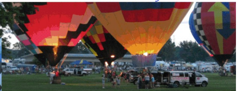
Friday evening glow