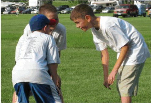
What to do while on hold? Play football!