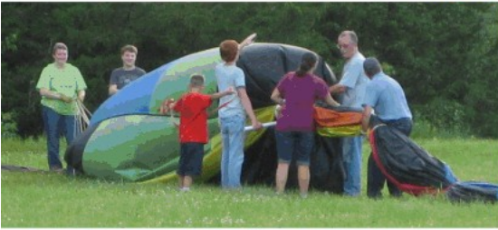
Packing up by the river