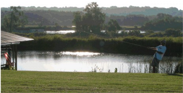
Beautiful launch spot