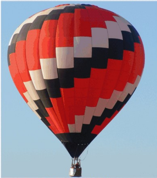
Appenzeller's new balloon!