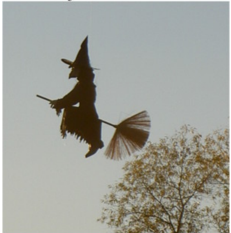
Seen flying over Sioux Falls (suspended under a balloon)

initiate a "Maiden Voyage Column" - to memorialize maiden voyage flights. Everyone who has a Maiden voyage - new balloon, new used balloon, new pilot, new rider, new crew, etc is welcome to write an article for the newsletter.