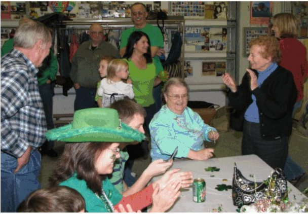
Members celebrate UNI's victory over Kansas