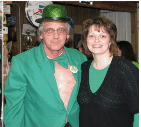
Irish Stew cook-off winners