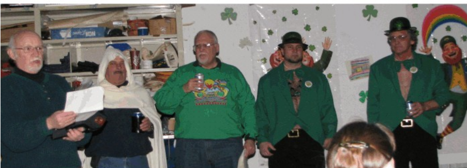
Founding Fathers & Giant Leprechaun