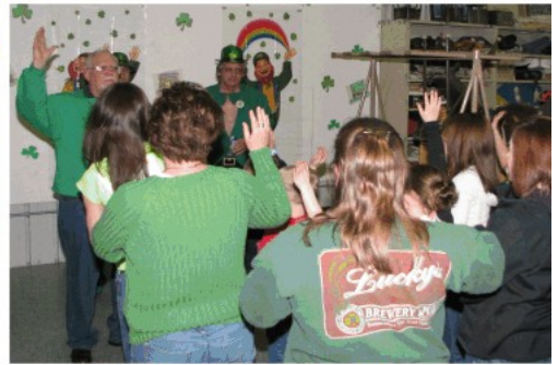
Members taking the BOI oath