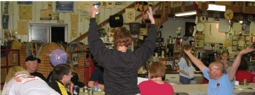
Touch & Go