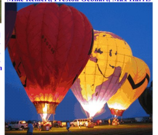
Old School Glow - Jack-o-Lantern, World balloon, Charlie Brown