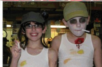
Redneck & Zombie Redneck