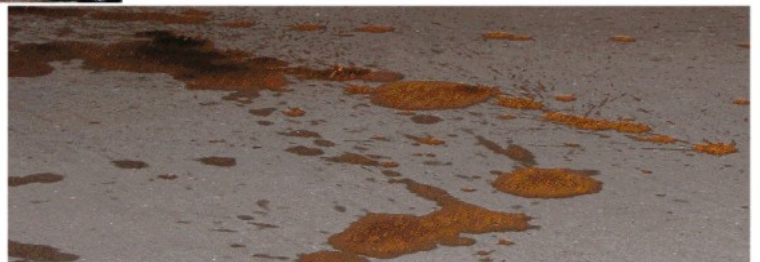
A lot of beer ended up on the parking lot - it was a record "crappy" year