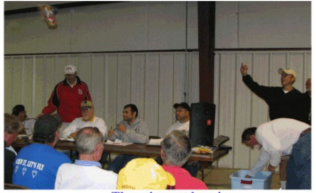
Throwing out baggies