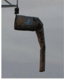
This can't possibly be Creston!