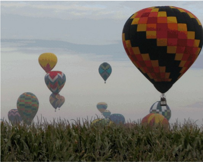
Sunday a.m. flight