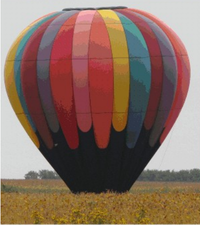
Fromm's new balloon "Ascension"