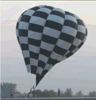
Ryan Kintzel lands at the airport Sat. pm