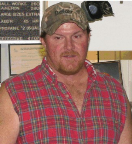
Larry the Cable guy