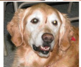
Sandy as "Sandy"