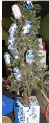
Redneck Christmas tree