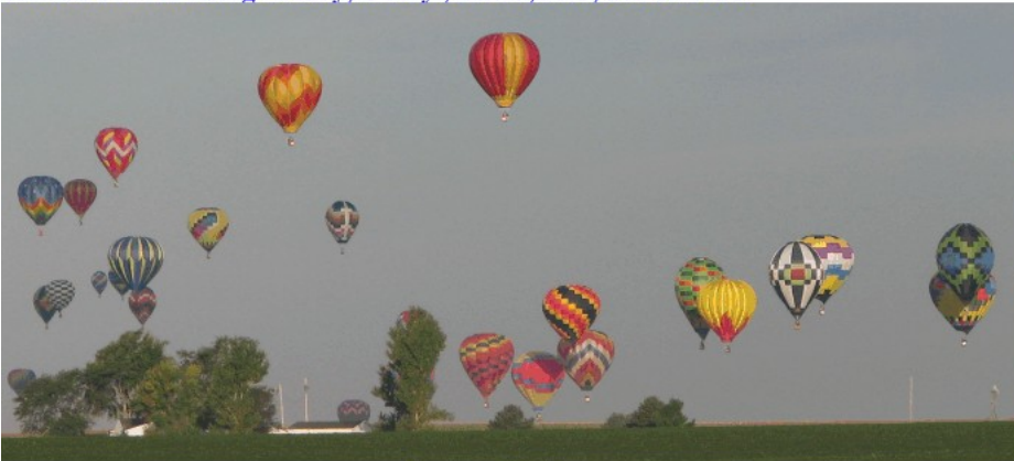
Sat a.m. flight