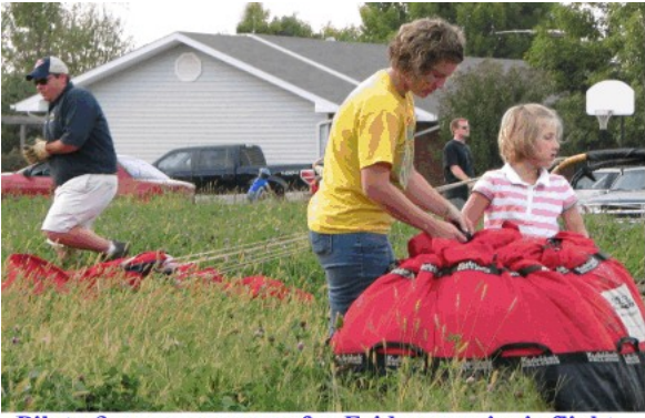
Pilots & crews prepare for Friday evening's flight