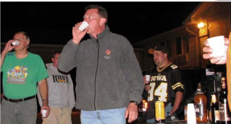
Crappy Beer Contest