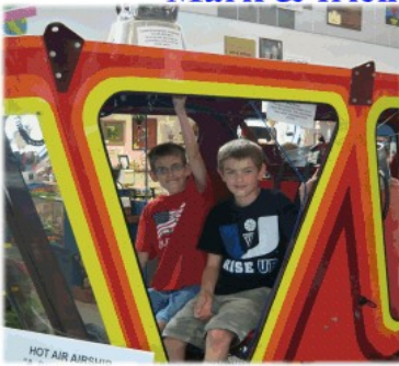
Rainy day trip to the museum