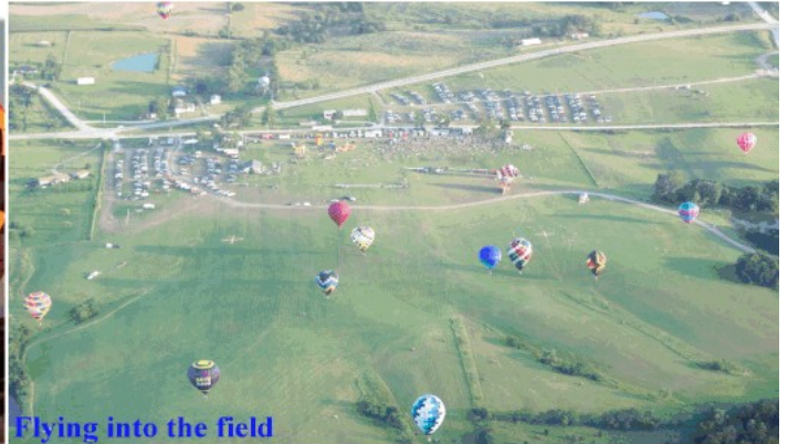
Flying into the field