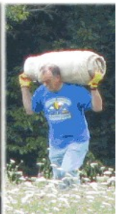
Carrying out one piece at a time