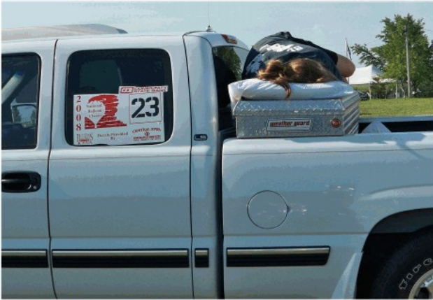
Those early morning flights are hard on crew!