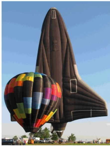
Wow, that shuttle is BIG!