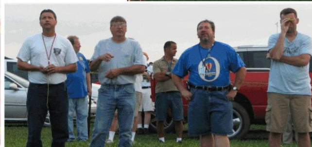
Watching the pibal