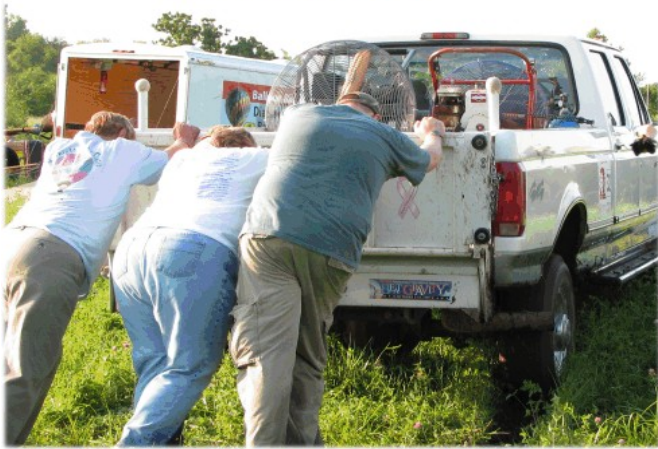
Getting stuck was part of the week