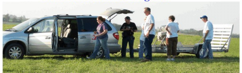
Does anyone have the keys? Yes - the pilot!