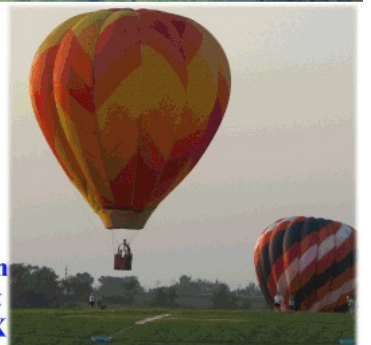
Jim Thompson flies right over the X