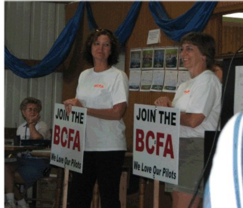
The BCFA Girls