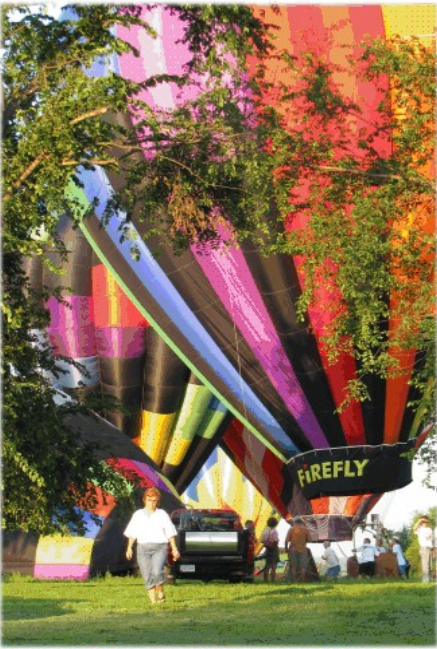
Landing at Green Acres