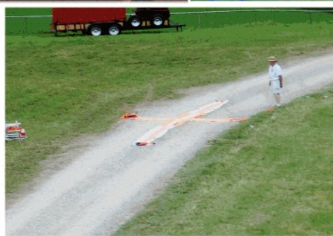
Target on the road through the field