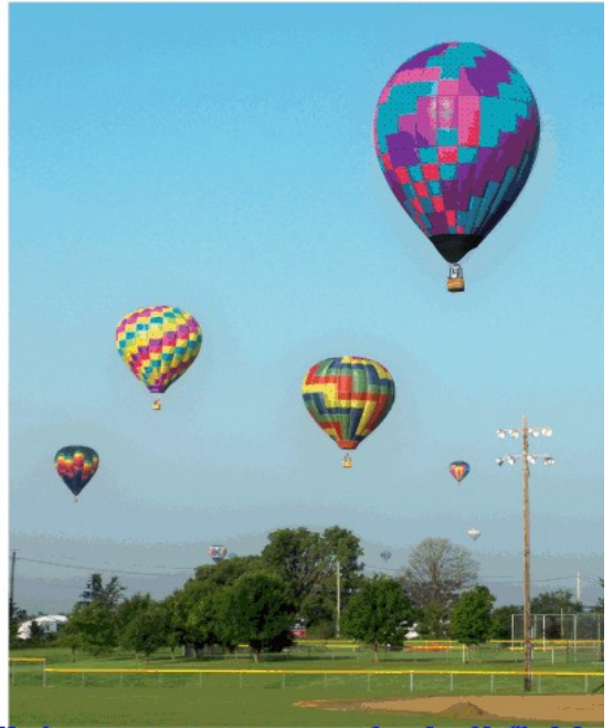
Flying to a target at the ball fields