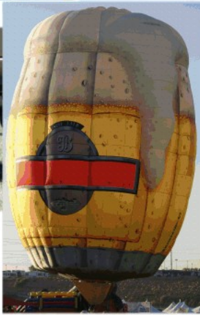
Now, that's a beer!