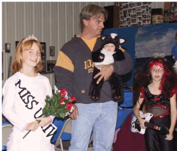
The Clair girls and Dad