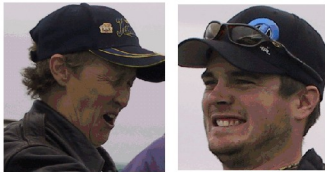
"Oh, that's bad"