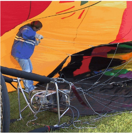
Inflating in tight spaces