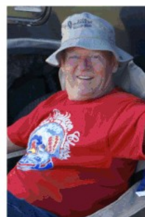
Red in red