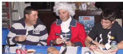
Chili Cook-off Judges