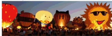
Special Shapes Glow