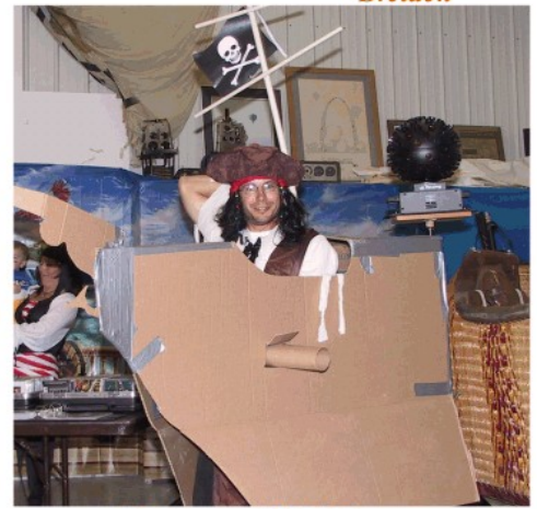
A pirate and his ship