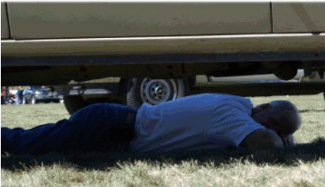
Mid-day nap in the shade