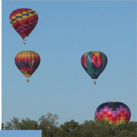
Pilots drop in for the target over the creek