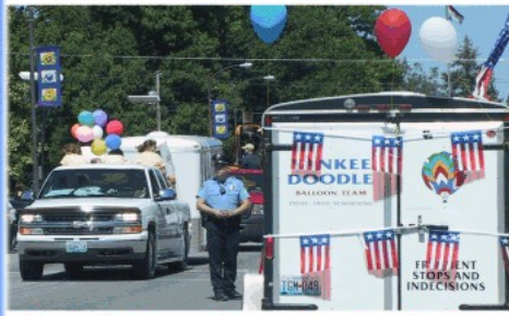
Brookfield parade - coming & going!