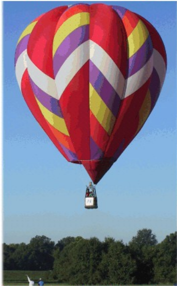
Kirk Bloom over the target