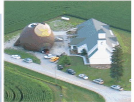
The Bear balloon launches from the newly re-built Farmers Chapel