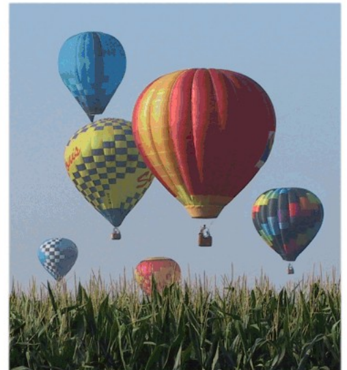
Flying over the Iowa corn