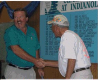
BCFA & Anit-BCFA put aside their differences & shake hands