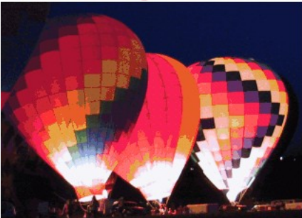
Touch & Go