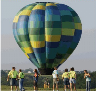
Thanks to the Launch Directors & the Scorers