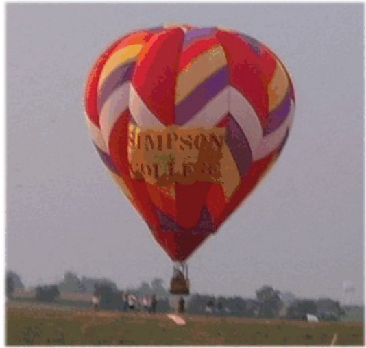
Kirk Bloom approaches the pole!