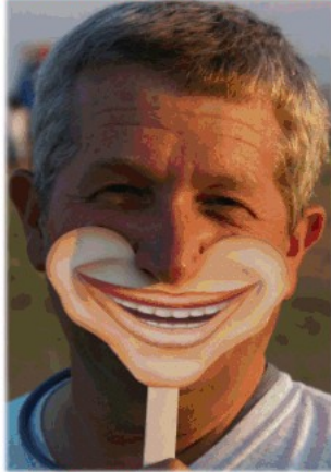
A big smile for the camera!