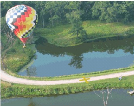
Target on the Dike