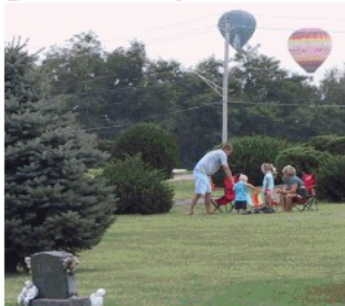
Spectating at the Cemetary?