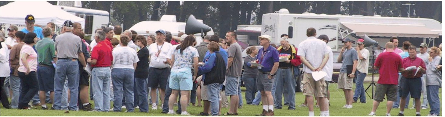
This pretty much sums up the weekend - lots of standing around waiting for the weather to improve!