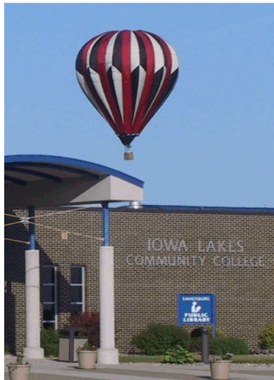
A good principal goes to the library as a good example for his students!