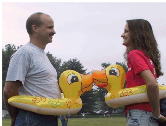
Safety officer protecting himself & his family in case the water gets too high!