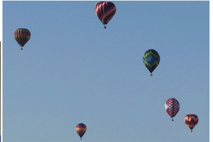
Balloons finally in the air Sunday a.m.