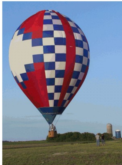
Brad flying right over the target Sunday evening.