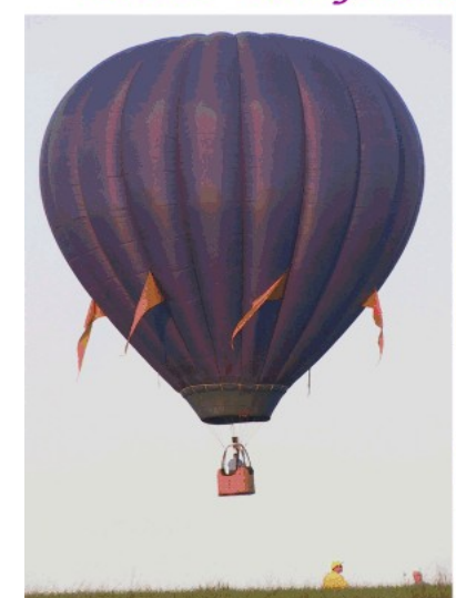
Bill in the lead for about 2 minutes