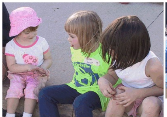
Crews wait patiently