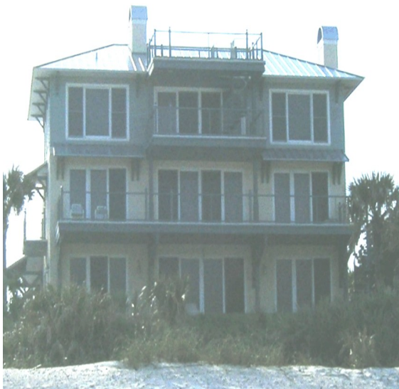
Possible Retirement site found in Florida by a BOI member. This facility might need some repair due to Hurricane damage.