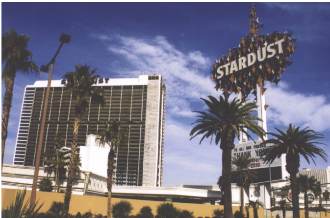
Located on the Strip - a perfect site to accommodate BOI retirees busy life styles