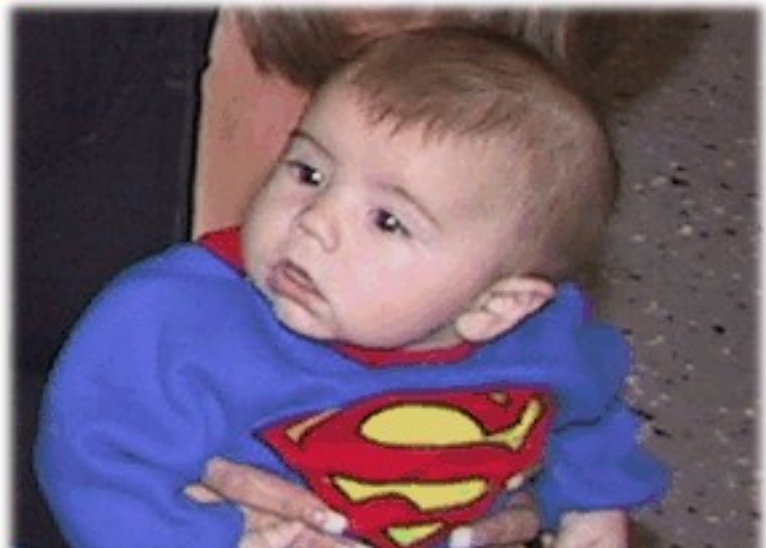
It was a very exciting party!