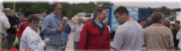
Crappy Beer Contest