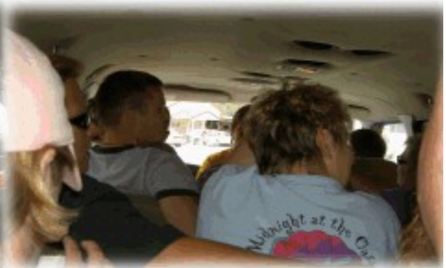
18 passenger van!