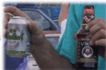
The winners - Grolsch & Viking Hot Chocolate beer