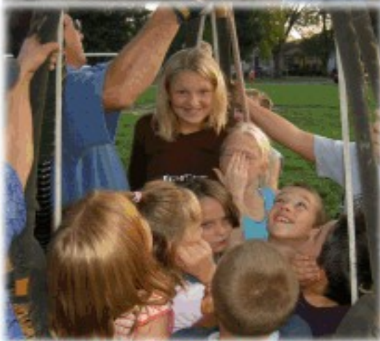
How many kids can you get in a basket?