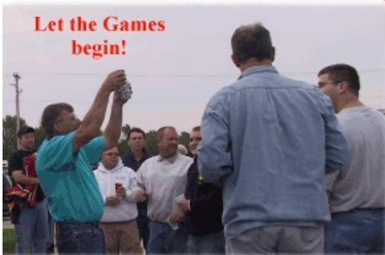
Let the Games begin!