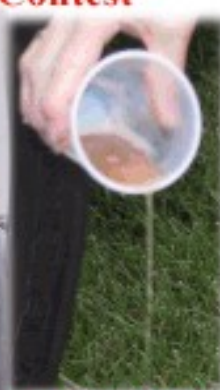
Must be really bad