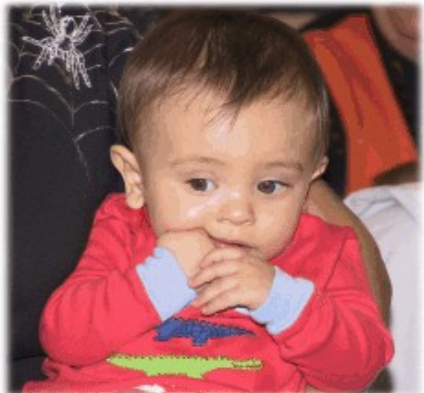
Old Business & New Business!