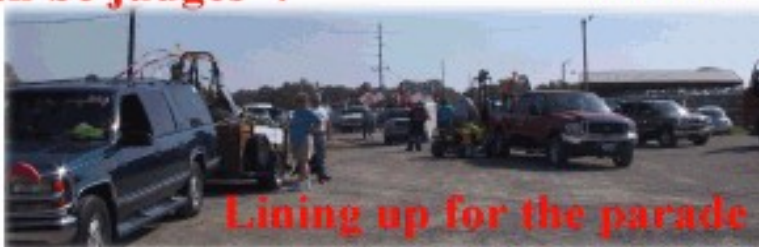
Lining up for the parade