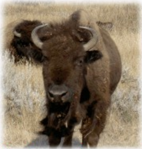
Up close and personal with a Buffalo