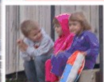
"In 16 years, we can be judges!"