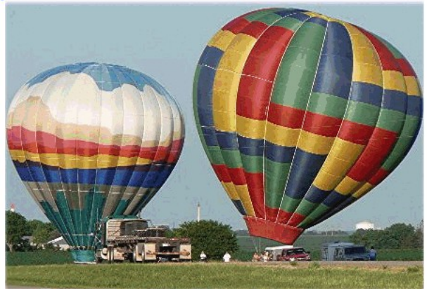
(hit a truck OR be hit by a truck)