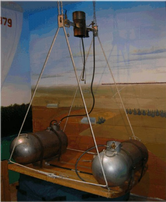
The Channel Champ