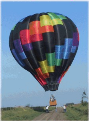
Good catch, crew!