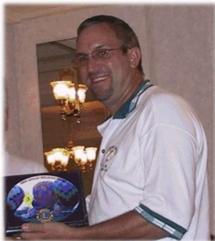
Gomer - 3rd place!