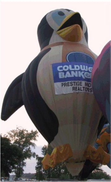
Dale's new Special Shape - Burgess